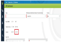
IRS_Sub.JPG 56 KB